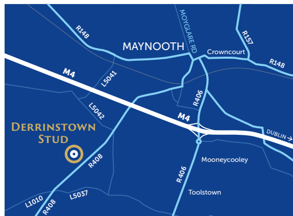
Derrinstown Stud location