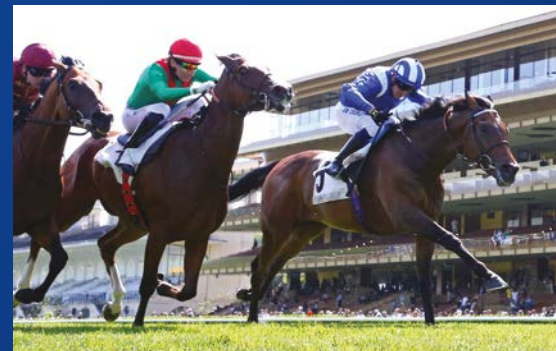
ANMAAT – winner of the Gr.1 Prix d'Ispahan

A Taad Moody (Muhtarram): third Ingabelle Stakes, L.