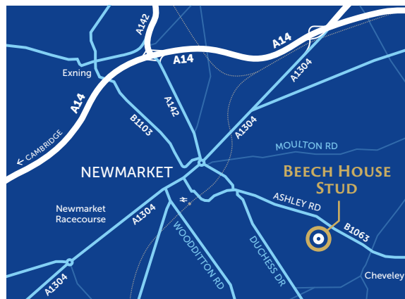
Beech House Stud location