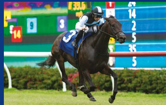
ANISETTE – winner of the Gr.1 Del Mar Oaks